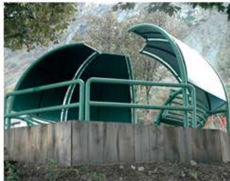
Vandal Resistant Structure