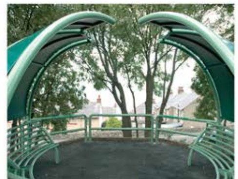
Hot Dipped Galvanized

Broxap Limited, Rowhurst Industrial Estate, Chesterton, Newcastle-under-Lyme, Staffordshire ST5 6BD Tel: +44 (0)1782 564411 • Fax: +44 (0)1782 565357/562546 • E.mail: sales@broxap.com • Web: www.broxap.com