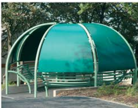
19 Different Configurations