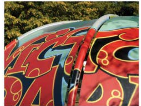
Available In A Variety Of Colours