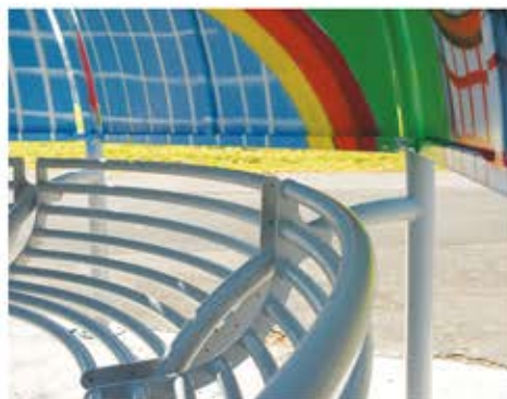
Ergonomically Shaped Seating