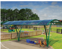
Covered Play Area