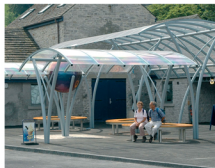
Covered Seating Area

Broxap Limited, Rowhurst Industrial Estate, Chesterton, Newcastle-under-Lyme, Staffordshire ST5 6BD