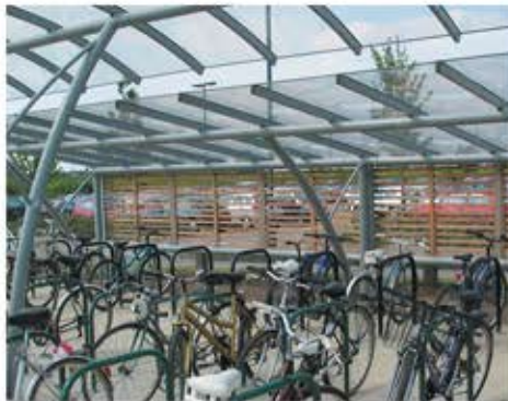
ClearView PETg UV Roof