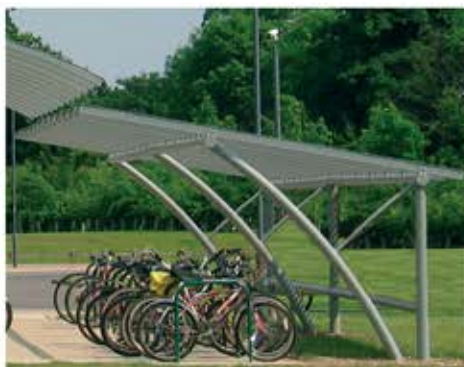
Tubular End Frames and Purlins