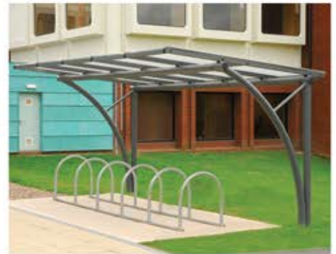
Cantilever Rear Supports