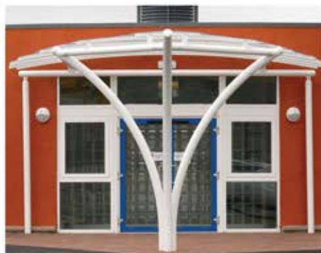
Curved Glazing Bar System