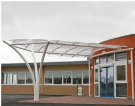
Robust, Tough Construction