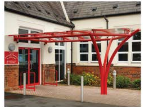
Base Plate Or Submerged Fixing