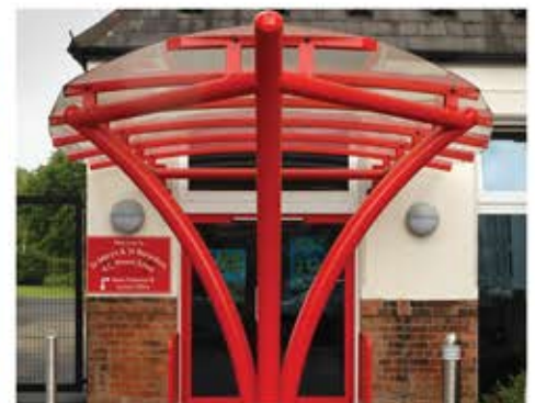
Hot Dipped Galvanized

Broxap Limited, Rowhurst Industrial Estate, Chesterton, Newcastle-under-Lyme, Staffordshire ST5 6BD Tel: +44 (0)1782 564411 • Fax: +44 (0)1782 565357/562546 • E.mail: sales@broxap.com • Web: www.broxap.com