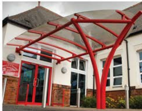
Assembled With Anti-Tamper Bolts