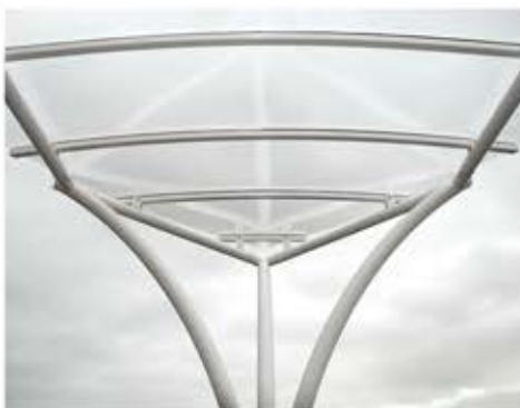
ClearView PETg UV Roof