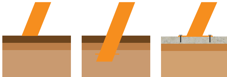
Surface Mounted Baseplate