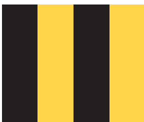
Black & Yellow

The colours shown are a guide only. Please check a colour chart to see the actual colour.