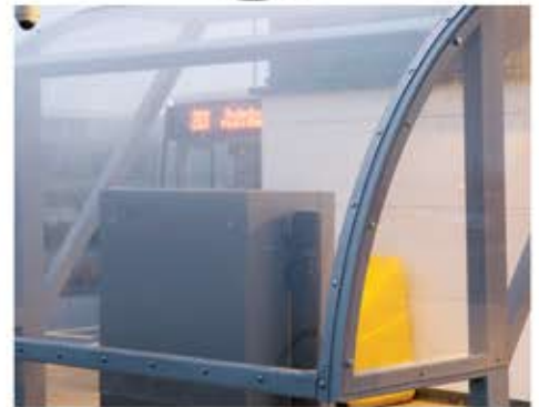
ClearView PETg UV Sheetting