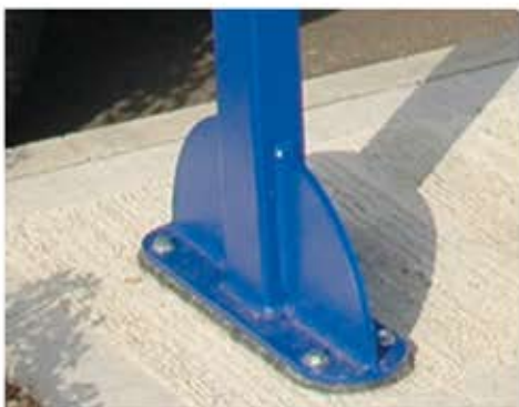
Base Plate or Submerged Fixing