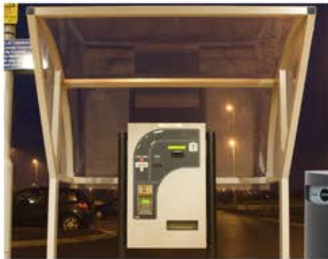
Assembled With High Strength Bolts