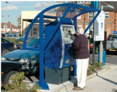
Robust, Tough Construction