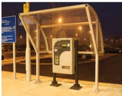
Hot Dipped Galvanized