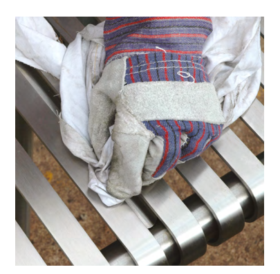
Rub liahtly with a soft non-abrasive cloth or sponge.