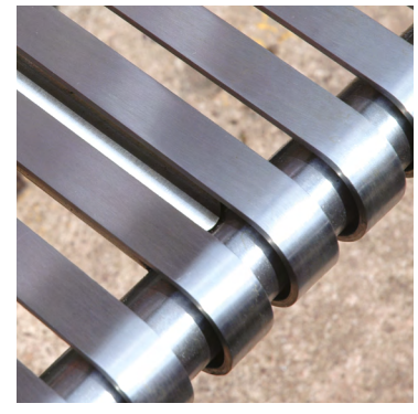
After the maintenance procedure a rich, vibrant shine synonymous with a stainless steel appearance.