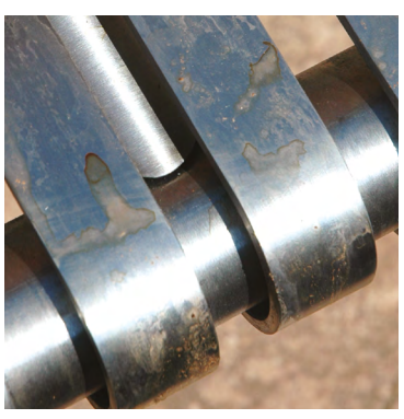
Stainless steel seat with discolouration due to weathering and non-maintenance.