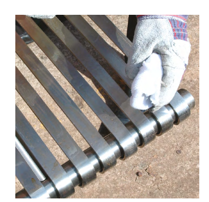
Spray the surface with a concentrated stainless steel cleaner.