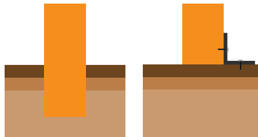
L-Bracket Surface Fixing