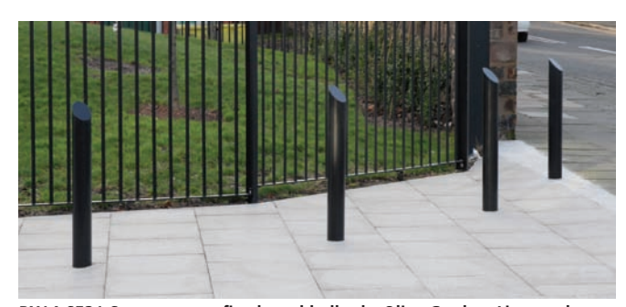
BX14 6531 Swansea root fixed steel bollards. Olive Garden, Liverpool.

Steel bollards may be converted to provide a removable option. Mild steel bollards are supplied with a mild steel socket into which the bollard is secured with a lug and padlock arrangement. The socket features a flush fitting lid which prevents tripping hazards.