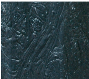
Black Recycled Plastic