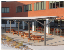
Covered Dining Area

Broxap Limited, Rowhurst Industrial Estate, Chesterton, Newcastle-under-Lyme, Staffordshire ST5 6BD Tel: +44 (0)1782 564411 • Fax: +44 (0)1782 565357/562546 • E-mail: sales@broxap.com • Web: www.broxap.com