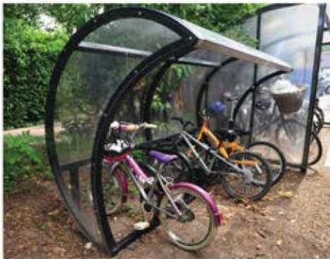
8 Cycle Capacity