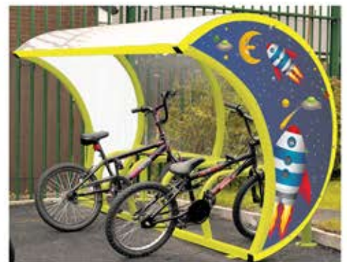
Variety Of Bright Colour Graphics

Broxap Limited, Rowhurst Industrial Estate, Chesterton, Newcastle-under-Lyme, Staffordshire ST5 6BD Tel: +44 (0)1782 564411 • Fax: +44 (0)1782 565357/562546 • E.mail: sales@broxap.com • Web: www.broxap.com