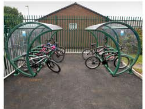
Face To Face