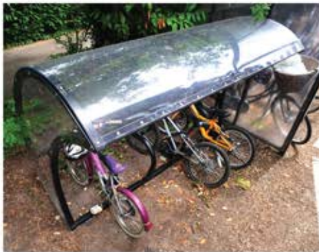
ClearView PETg UV Roof