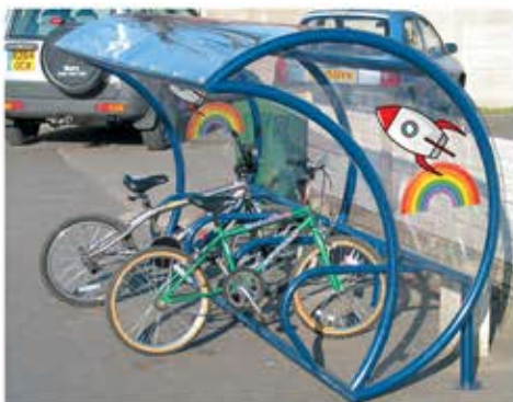
Fixed Base Shelter