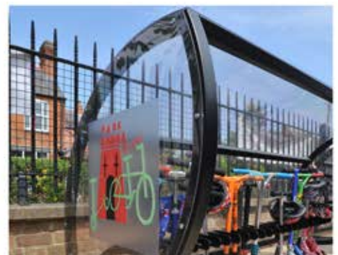
Colourful Graphics Are Available

Broxap Limited, Rowhurst Industrial Estate, Chesterton, Newcastle-under-Lyme, Staffordshire ST5 6BD Tel: +44 (0)1782 564411 • Fax: +44 (0)1782 565357/562546 • E.mail: sales@broxap.com • Web: www.broxap.com