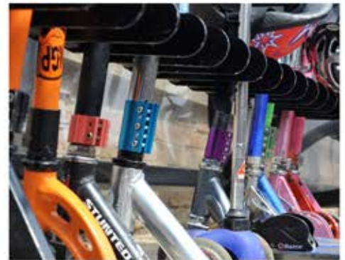
Caters For Cycles & Scooters