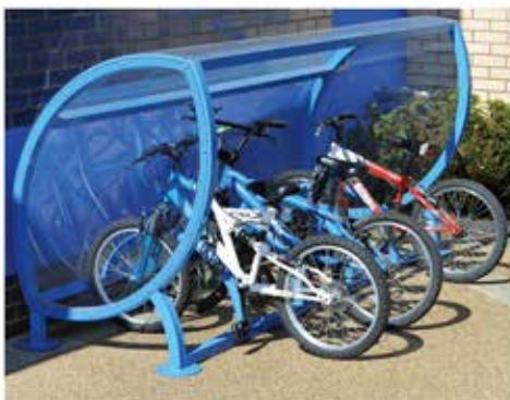
8 Cycle Capacity