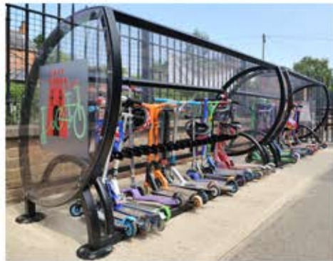
Child Friendly Cycle Shelter