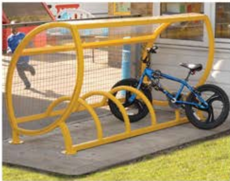
Leaf Shaped End Panels