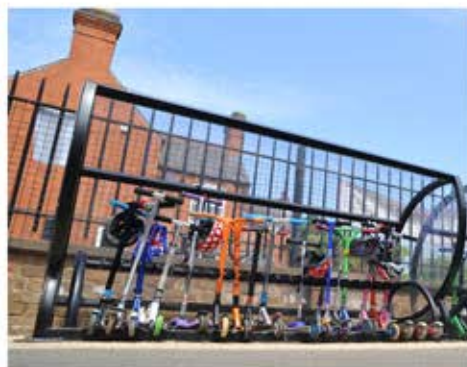
ClearView PET Panels